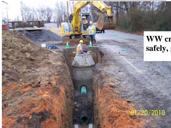
WW crews working safely, great job!