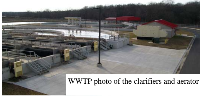
WWTP photo of the clarifiers and aerator

REMEMBER: An exercise program can be a fun addition to your week that doesn't have to cramp your schedule. Do a variety of exercises, set realistic goals for your routine and your fitness level and enjoy yourself.